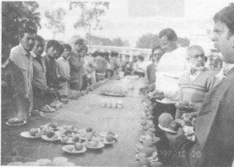
সর্বস্তরের কর্মচারীদের নিয়ে অরকার চা-চক্র