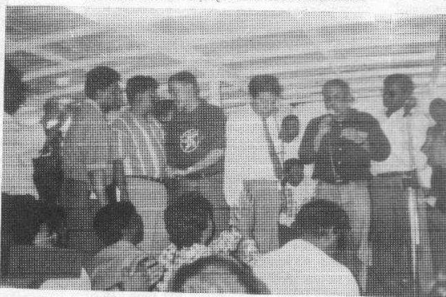
Ex-President (mike in the hand), present President, present VP-1 gave their best to raise LTS at the Feb'98 River Cruise