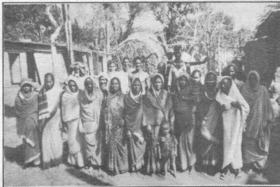
Some of the Flood Victims waiting for the relief