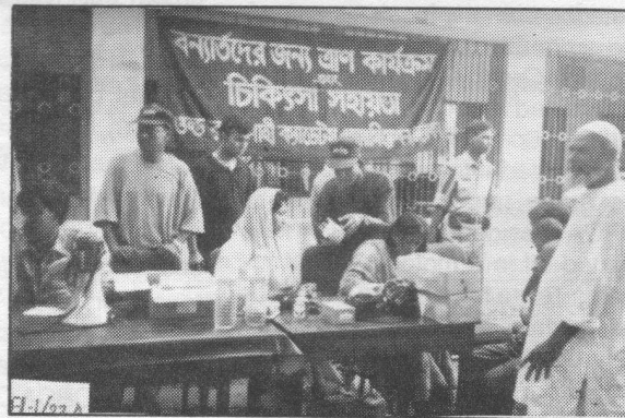
ORCA'S dedicated Medical Team in operation

The Dhaka convoy arrived at Savar Cantt. at 10:45 am. After taking short breakfast and loading the relief goods and filling the rest of the drinking-water-containers, the revitalized and enlarged convoy of 7 vehicles (ORCA President's