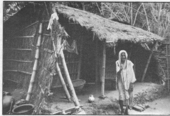
One of the Flood Victims