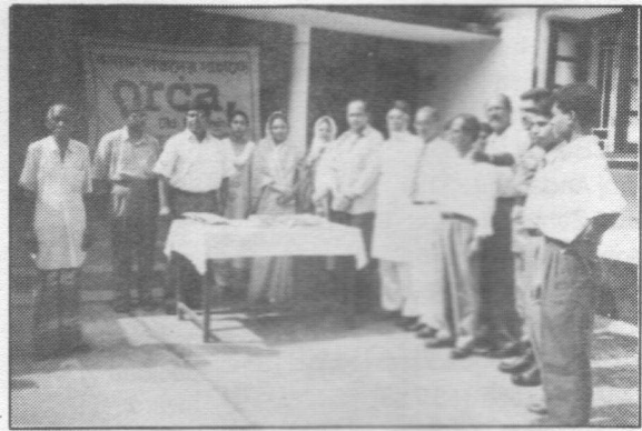
ORCA Relief Team

At Tewta distribution of relief goods from the boat continued for a long time. Free medical services and