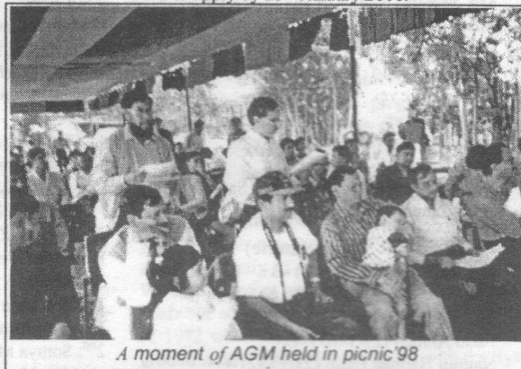
A moment of AGM held in picnic '98

ORCA Annual Picnic was held on 18 th December 1998 at Savar Dairy Farm. Total member of participants was about 300. It was full of fun and laughter. Both senior & junior cadets enjoyed the picnic to their heart's content. At the beginning of the picnic a general meeting (AGM) was held and decision was taken to provide scholarship for next generation. Trustee Board was also at AGM after a long and well participated discussion.