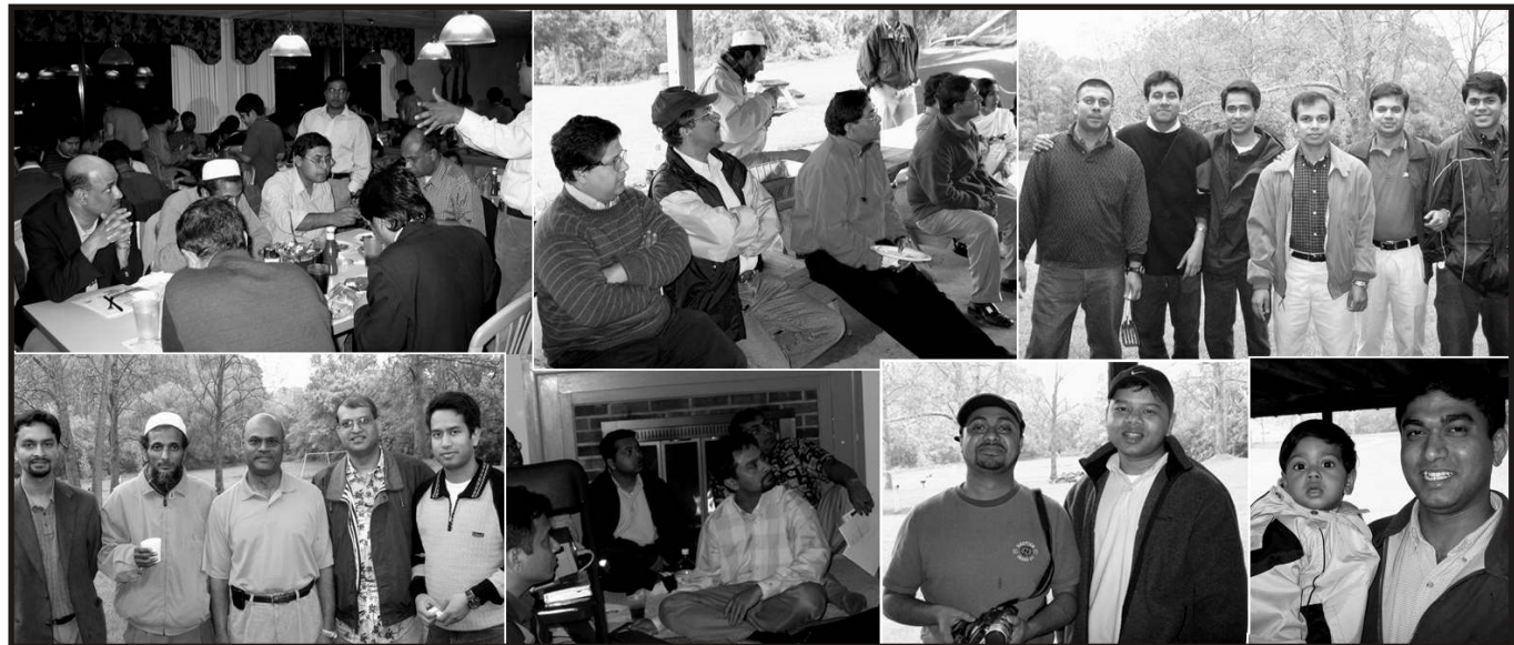
PHOTO GALLERY of USA REUNION 2003