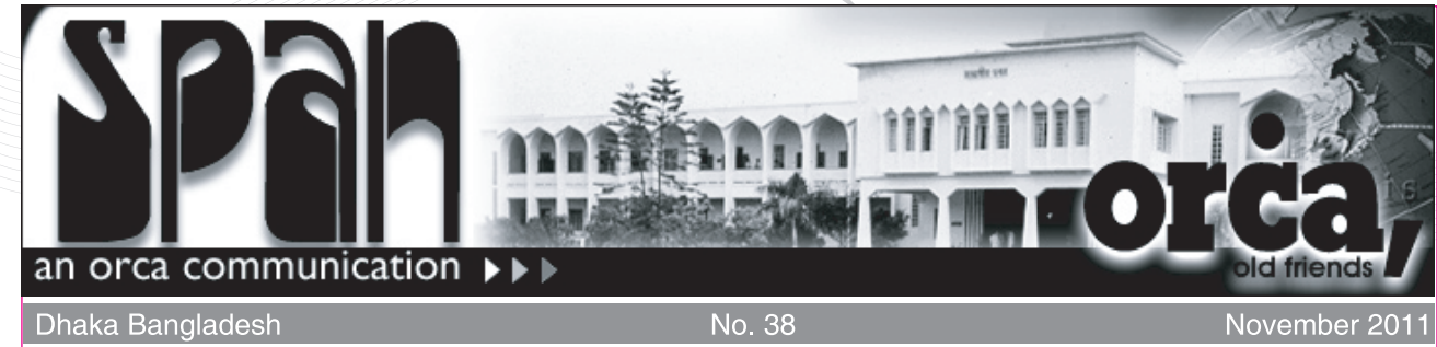
Dhaka Bangladesh No. 38 November 2011